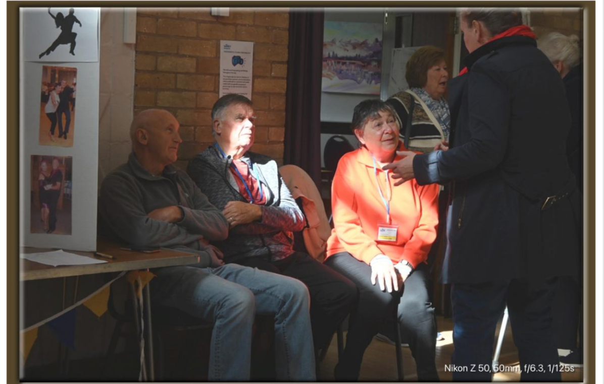
Open day discussion