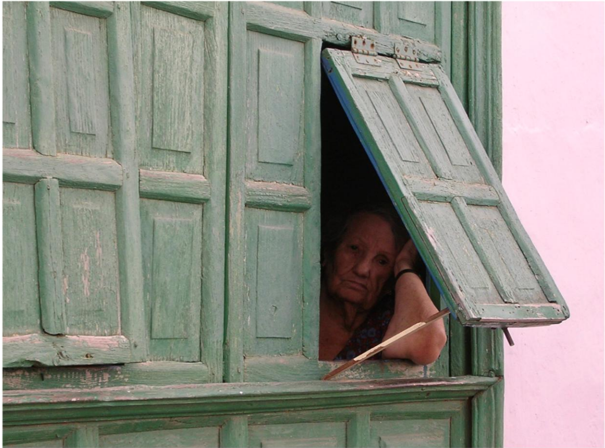
In the shade