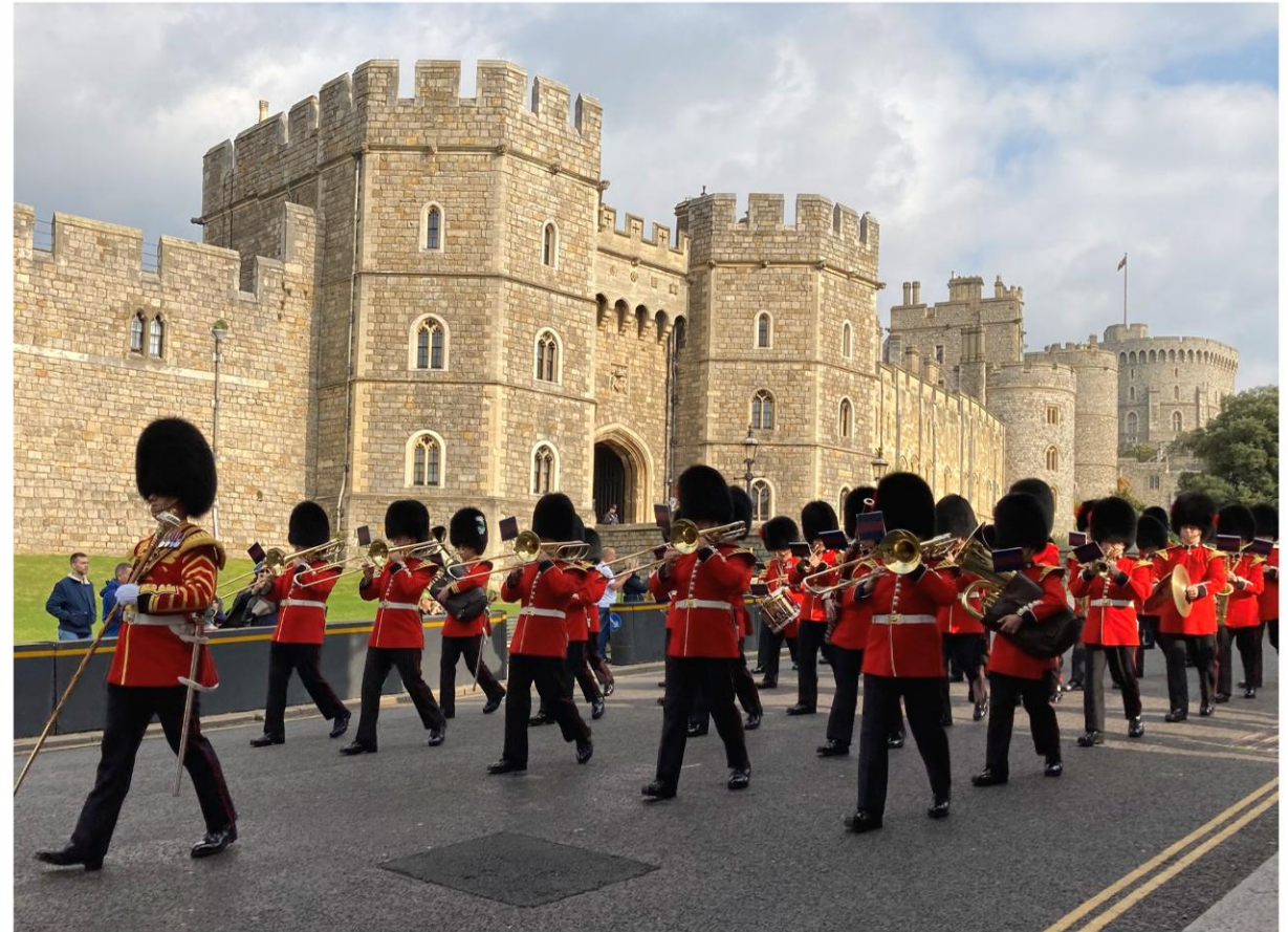
By the Right