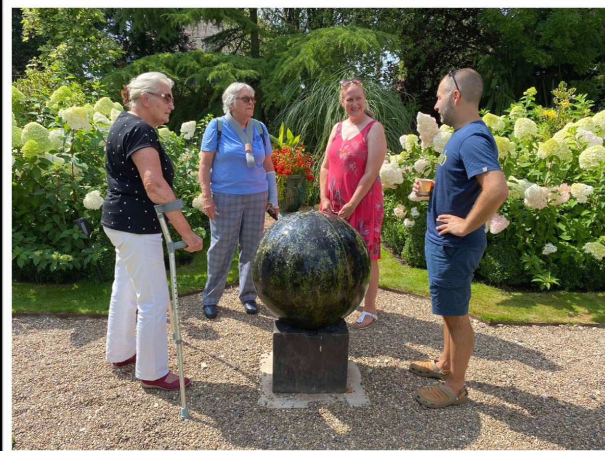
An Earnest Discussion