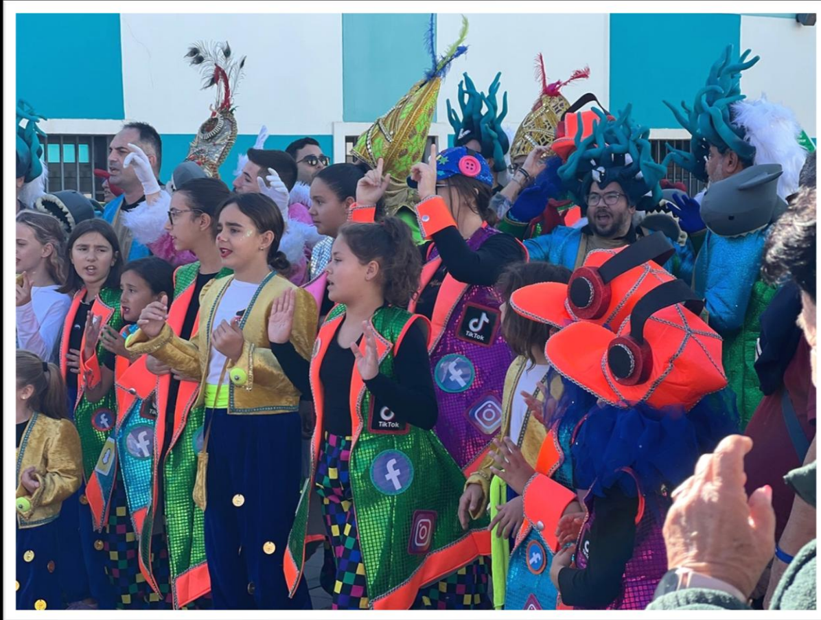
Celebrating the Sea