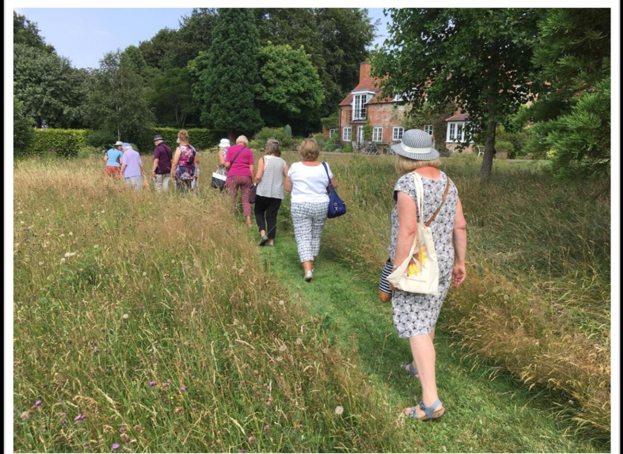
Leading Lines at Southwell