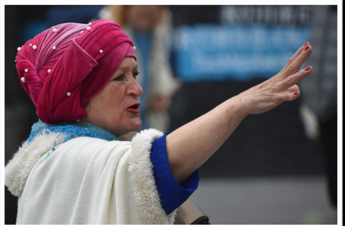
What is She Saying?