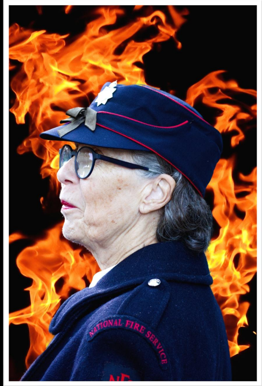
Don't Panic (composite)