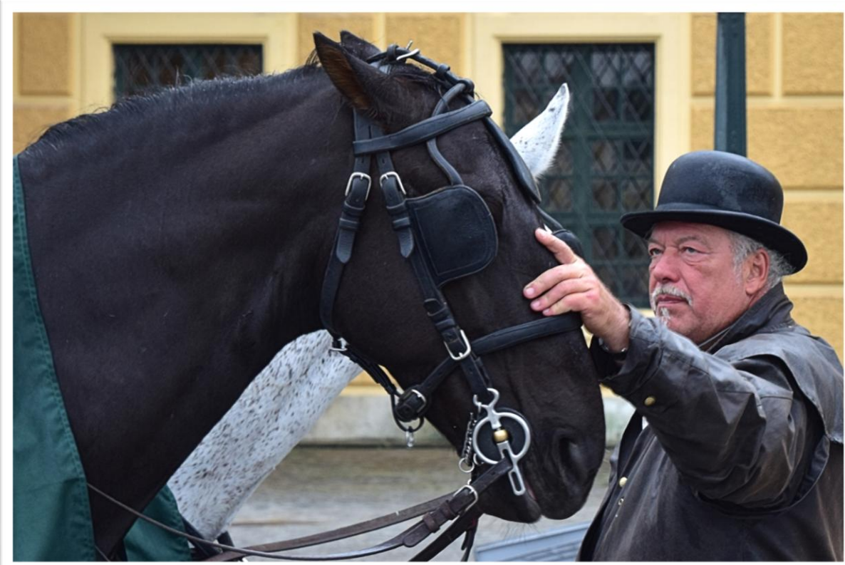
A man and his horse