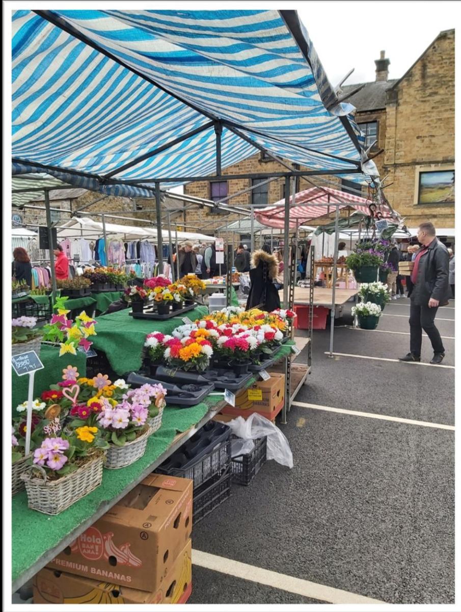
Market in Bakewell