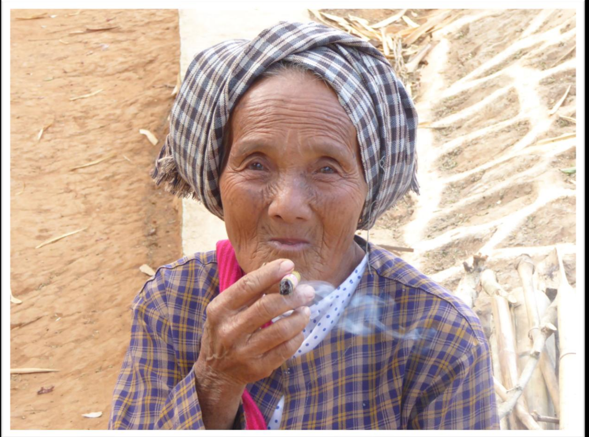
Pa-O Lady with Cheroot - Burma