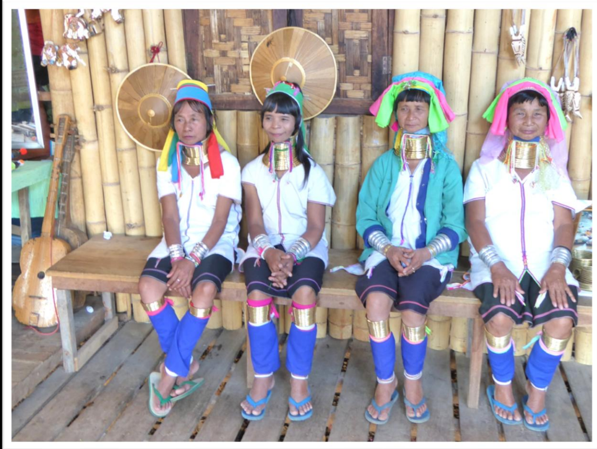
Longneck Karen Tribe - Burma