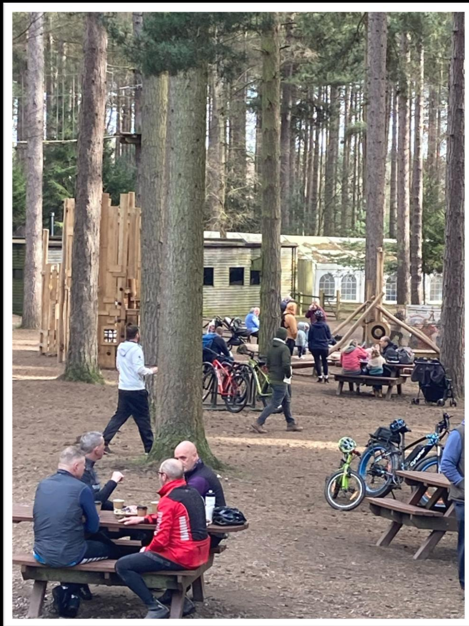
Sherwood Pines Visitor Centre