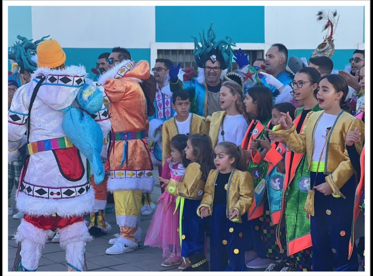
Singing Sea Shanties