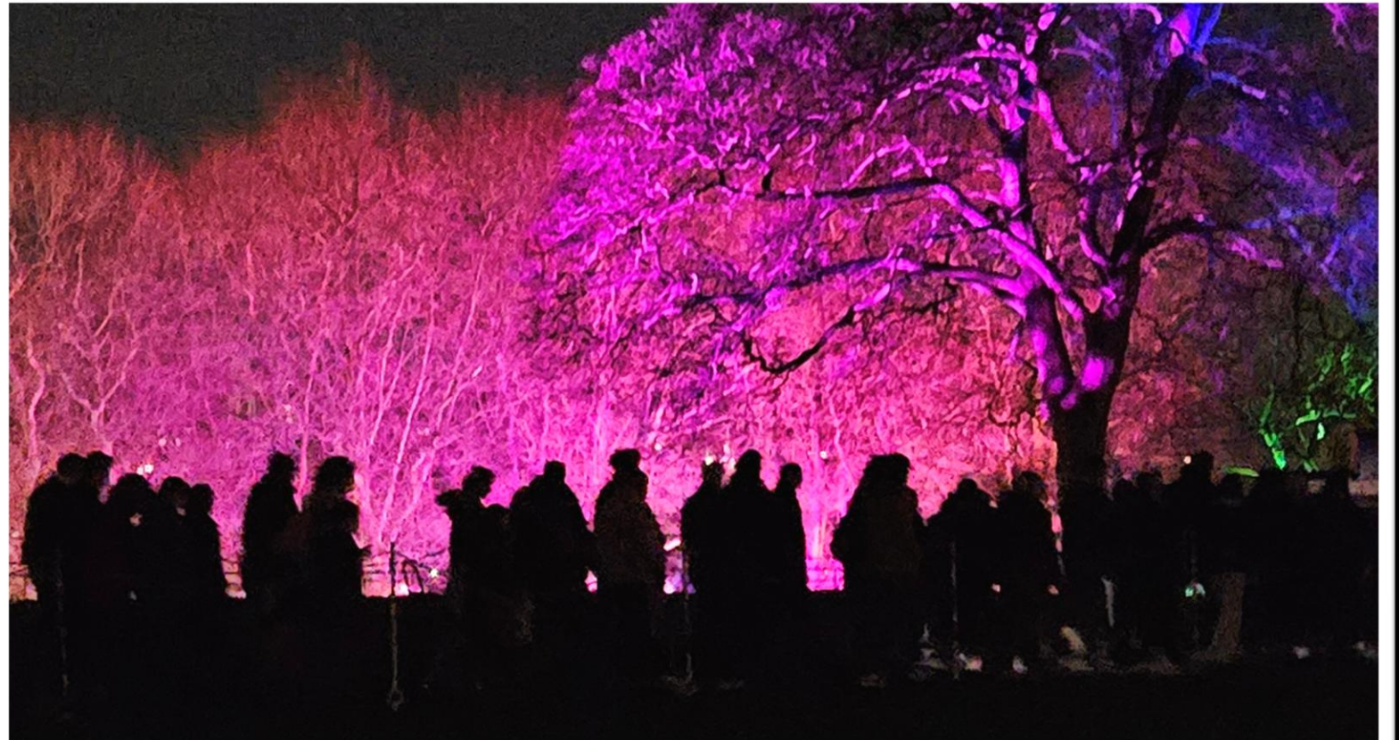
Nottingham Night Light 2025