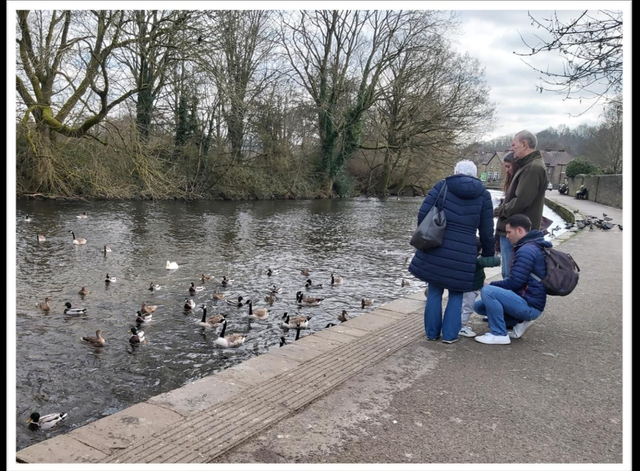
Feeding the ducks - Bakewell