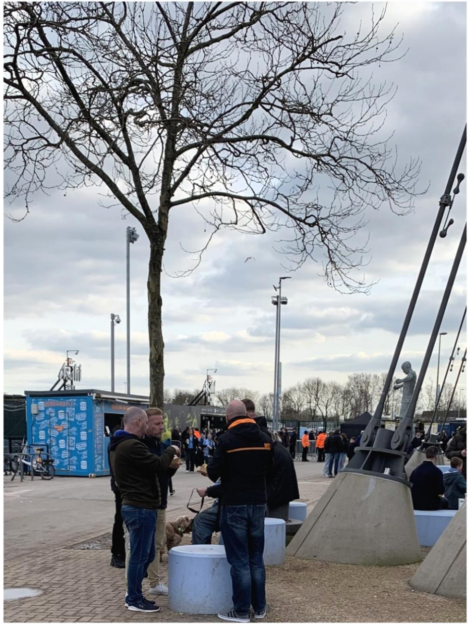
Outside the Etihad