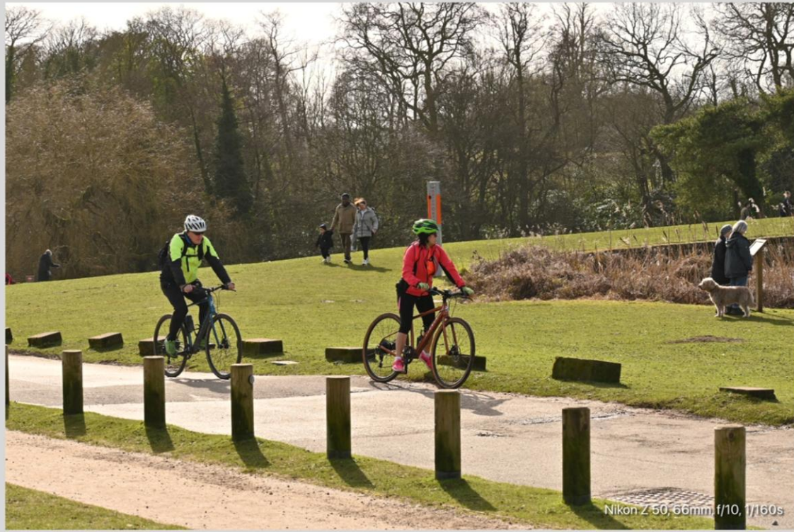
Riding through the Park