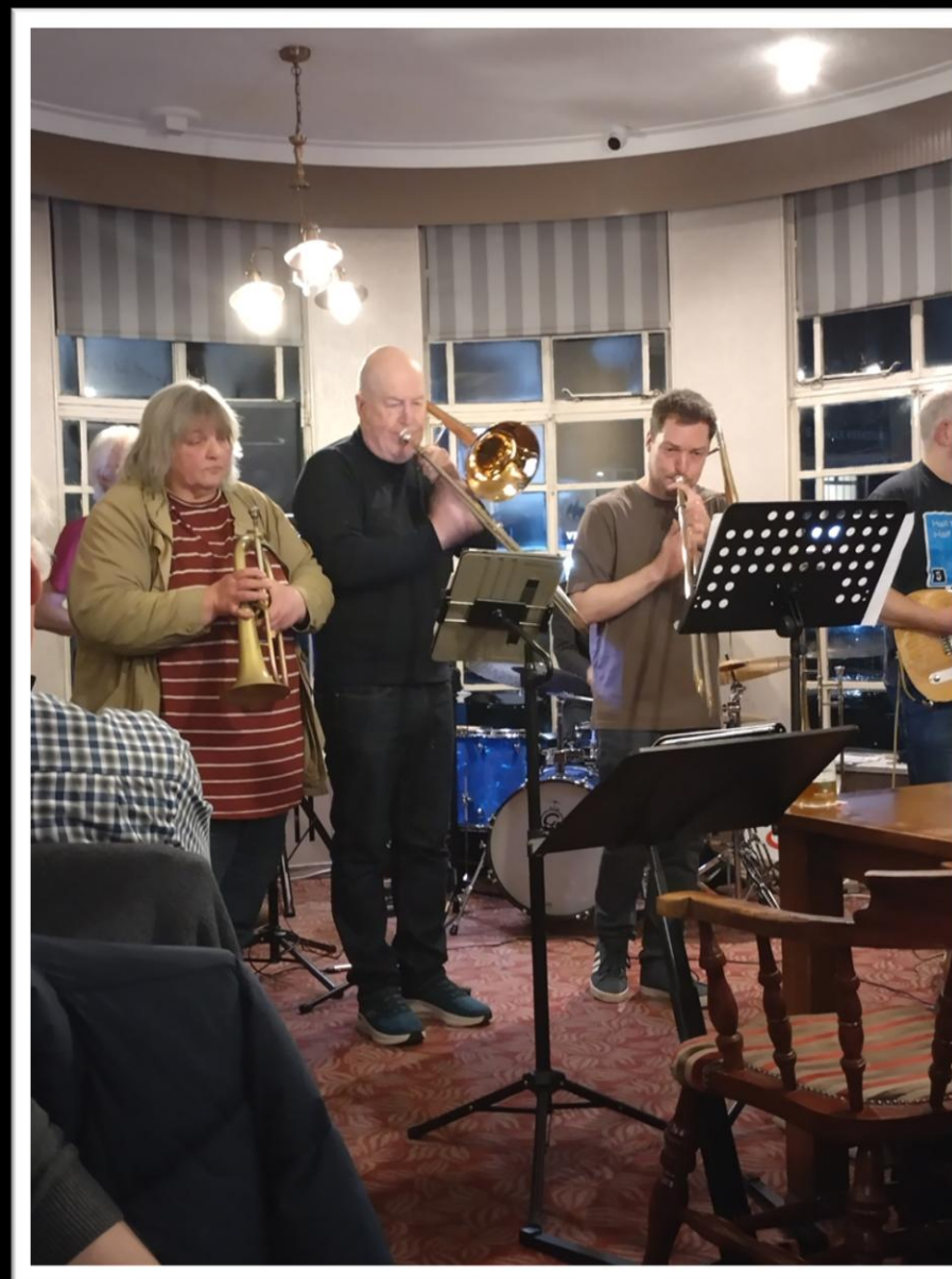
The Vale - Jazz Night