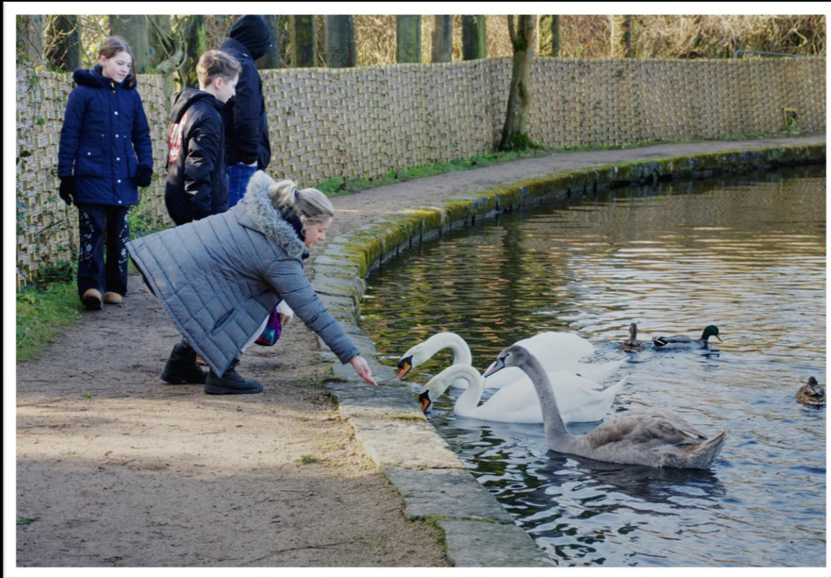
Feed the birds