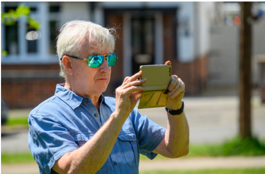
Charles captures the moment