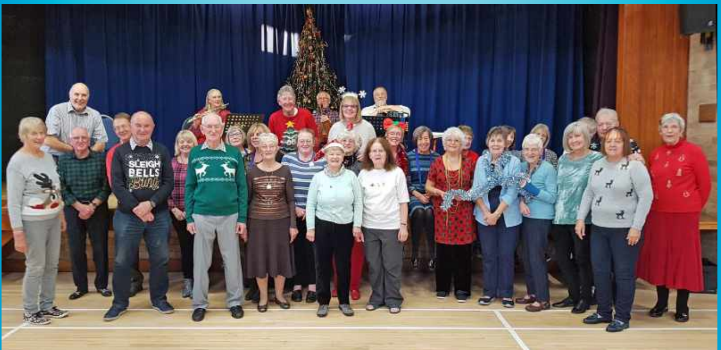
The Folk & Country Dancing group in festive mood at their recent Christmas dance.