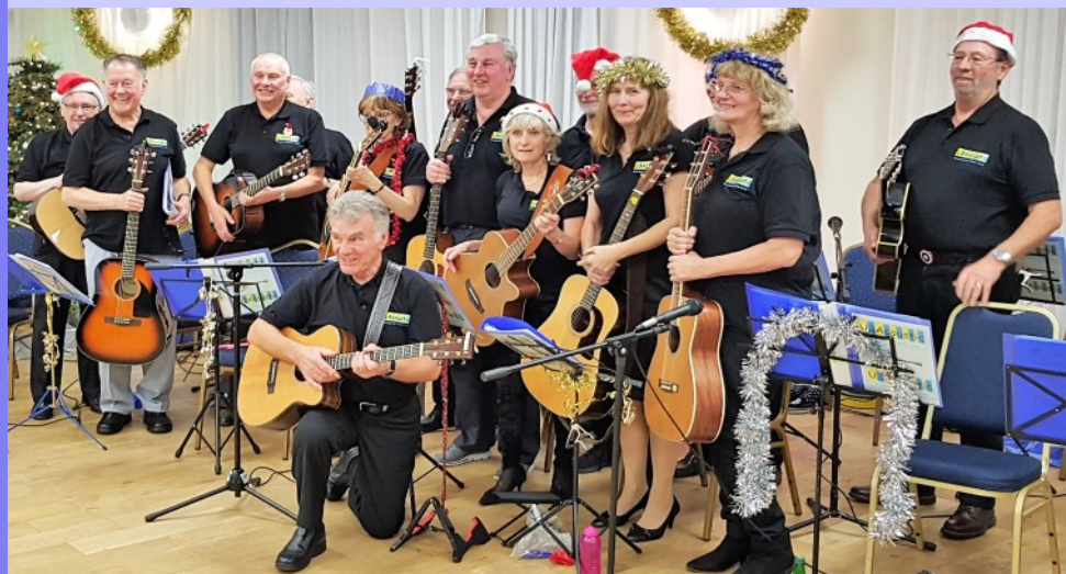
U3Acoustics entertained the members at the Christmas lunch in December.