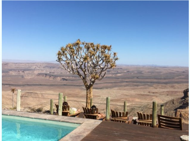
Fish River Canyon with a Quiver tree and swimming pool right on the edge

largest canyon in the world. It may not be as deep or as long but at 27km, it is wider than the Grand Canyon, and in the bottom there is, in parts, a small trickle of water (it was the dry season) which was the Fish River. The views were breath-taking. Some people venture on foot down into the canyon which takes three hours